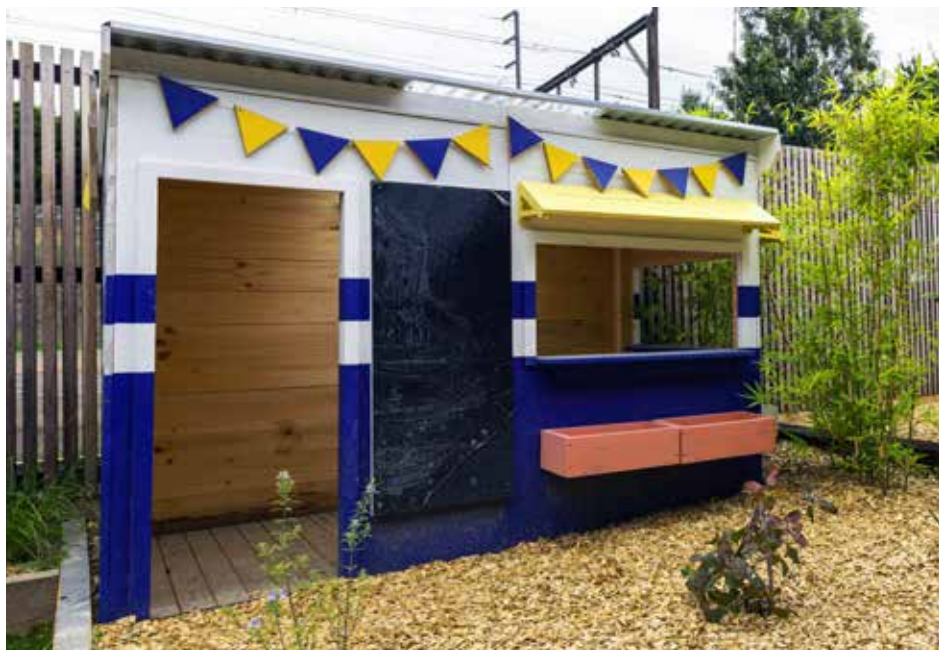
This delightful cubby at the new Playstation, is ready to be explored